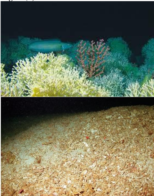
The top Oculina coral reef is undisturbed. Trawling has devastated the one below, located at Oculina Banks off the coast of Florida. Only about 10 percent of Oculina habitat remains intact.

years of climate change, tectonic shifts and other global events through evolution, only to be destroyed by massive metal weights being dragged behind the boats of such fishermen (See figure 5). John Pickrell, from National Geographic, reported on the subject concerning actions being taken by the United Nations, “Concerned that many species may be lost before they are identified, a group of 1,136 scientists from 69 countries is (are) appealing for new laws to protect deep-ocean corals and sponges... ‘We urge the United Nations and appropriate