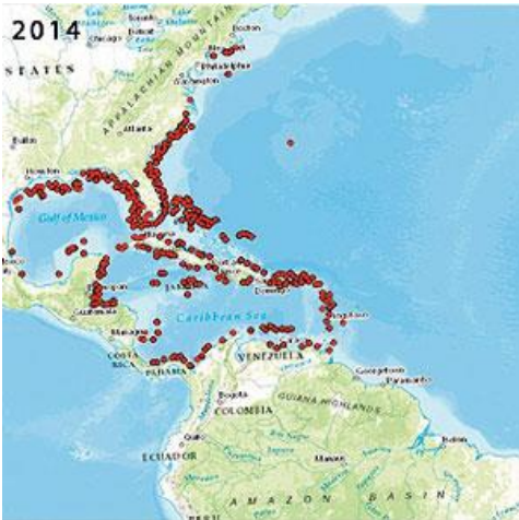
Encyclopedia of Modern Coral Reefs: Structure, Form and Process