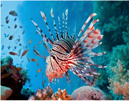
Encyclopedia of Modern Coral Reefs: Structure, Form and Process

The rising populations of lionfish within the keys and gulf coast regions of Florida continue to mar the fragile reefs in the region: In order to combat this invasive species a number of organizations have begun to raise awareness for the issue through competitions and