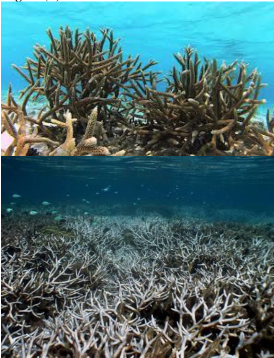
In 2007, these Acropora corals in the Tumon Bay Marine Preserve in Guam bleached, likely due to higher-than-normal water temperatures caused by global climate change.

put forward a convincing case that corals, uniquely, foretold with great accuracy the coming of global climate change—they could be considered the mine shaft canaries of approaching climate problems.”(Winchester, Chapter 9: pg. 342) Such statements couldn't be more true considering that corals are some of the most acutely sensitive of all Mother Nature's early-warning devices. Within the last 18 years alone, Earth has experienced its ten hottest years in any recorded history(See figure 2); thus, coral bleaching has become increasingly prevalent. From the Bahamas to Guam to Australia more and more reefs are being destroyed by such events; unsurprisingly,